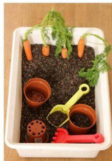
Spring Sensory Play Nurturedstore - inspiration for kids

Create a little area of the garden to plant or play gardening activities using soil, buckets, trowels and other everyday items.