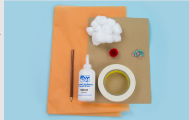
- Sticky tape